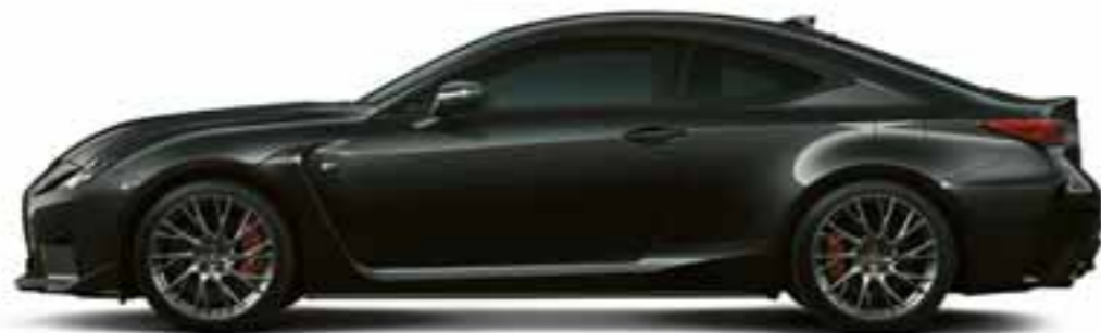
Graphic Black bodywork, 19" forged alloy wheels, V8 engine under the bonnet

Whether you're driving on the racetrack or open road, the new RC F sports coupé delivers awesome V8 performance right up to 270 km/h. Now sharper and more exhilarating than ever before, the RC F's new look was inspired by the Lexus RC F GT3 race cars. Developed at our technical centre near Fuji Speedway, the car features an extraordinarily rigid chassis and race-tuned suspension. For the sharpest standing start acceleration, the new RC F is also equipped with electronic launch control as standard, a system which automatically adjusts the traction and throttle for maximum take-off from standstill.