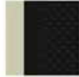
F White Accent