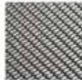
Glass Fibre, Silver