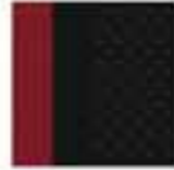
Flare Red Accent